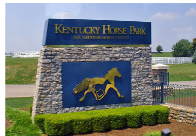
Kentucky Horse Park

Take a side trip to Lexington and visit the Kentucky Horse Park, Calumet Horse Farm, and the home of Mary Todd Lincoln.