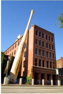
Louisville Slugger Museum

It's not too early to be thinking of next year's annual meeting in Beautiful Downtown Louisville, KY.